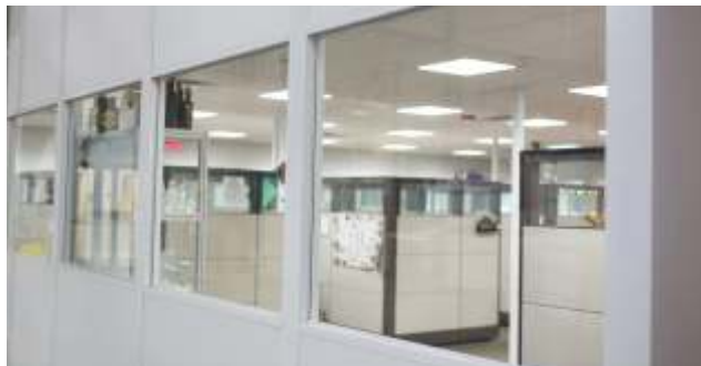
→ Glazed Vision Panel